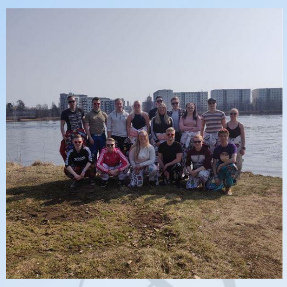
Olto joined the event called "Kirkkovenesoudut" where the main thing is to row a boat as a team as fast as possible and have some fun.

Oulun lääketieteen tekniikan opiskelijat (students of medical technology in Oulu) ry aka OLTO is a guild established in 1993, which works to unite students of medical technology in University of Oulu and all the students interested in the field. OLTO's goal is to keep up good contacts to companies, experts and other universities and other guilds in the same field in other guilds, aka sister guilds.