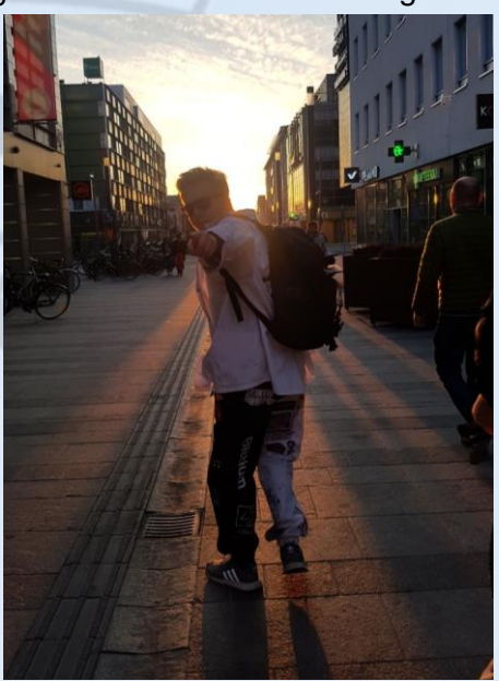
Ps, feel free to come ask anything!

Once again, congratulations and good luck with new interesting studies!